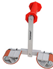
CARRYMATE XL span width 80-160 mm