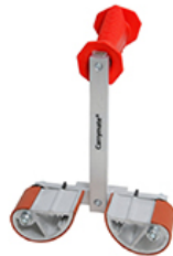
CARRYMATE Senior span width 40-120 mm